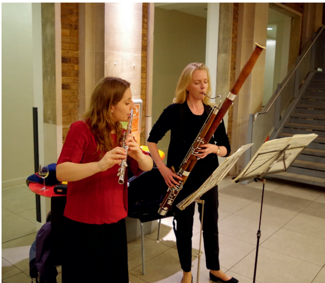
Musical entertainment during the poster session.

The resulting workshop was made possible by a generous grant from the U. S. Office of Naval Research (Global) and the U. S. Air Force Office of Scientific Research International Office, which enabled a total of some eighty participants, by invitation, from thirteen different countries, to converge on UCL for the event. These included some of the ‘big names’ in radar research from all over the world, with clear ideas and strong opinions. A poster event on the first evening was kindly supported by the Australian High Commission in London, also with support from the IEEE AES Society.